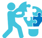
Maritime Ports Business Intelligence