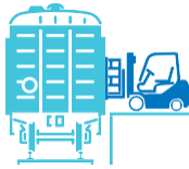
Multimodal Terminal Management

Respond to the needs of the stakeholders in the sector: logistics operators, agents, freight forwarder, transport integrators and logistics platforms.